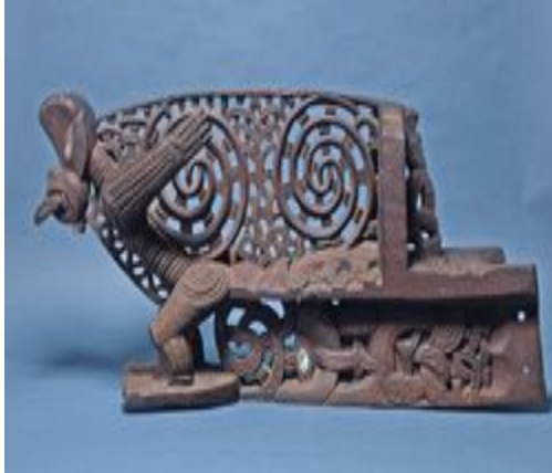
Maori canoe bow

WHO: Teachers K-12 WHEN: Friday, June 24, 2011 TIME: 9:00 a.m. – 4:30 p.m. WHERE: University of Pennsylvania, Museum of Archeology & Anthropology INSTRUCTOR: DIAE Staff CREDIT: 6.5 Clock Hours